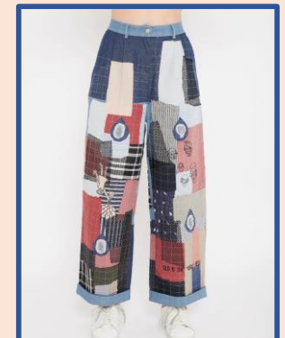
Doodlage Applique denim