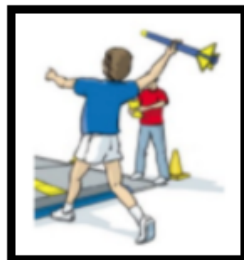
Javelin overarm throw