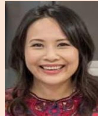
Ching He Huang

Ching-He Huang MBE, is a Taiwanese-born food writer and TV chef. She has appeared in a variety of television cooking programmes, and is the author of nine best-selling cookbooks. Ching is recognised as a foodie entrepreneur, having created her own food businesses. She is known for adapting Chinese recipes to make the most of seasonal produce.